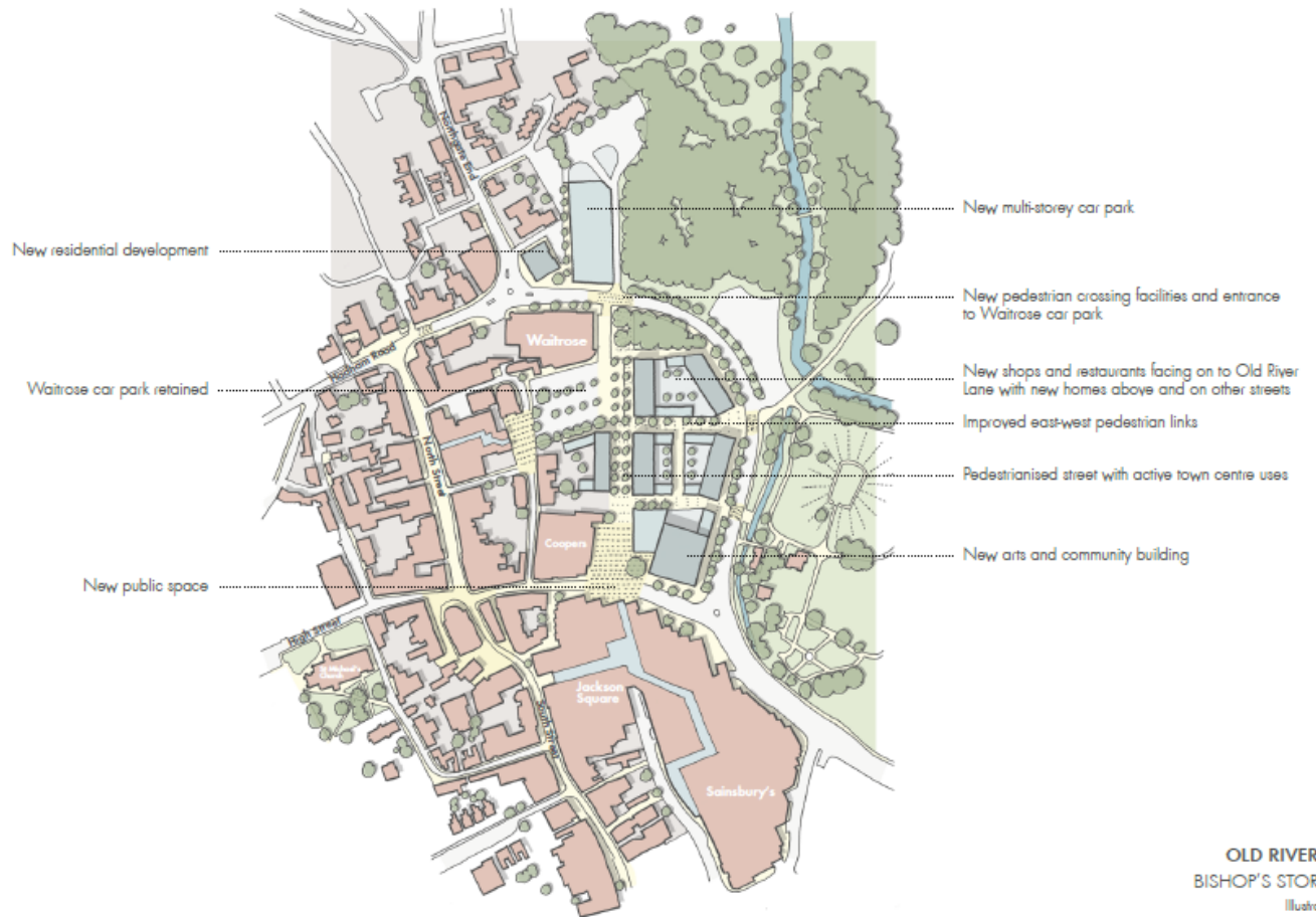
OLD RIVER LANE BISHOP'S STORTFORD Illustrative plan Allies and Morrison November 2017

This would be a residential scheme as there would be less scope / traction for retail/leisure use on the site without an associated arts offer.